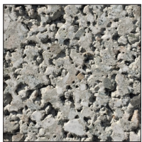
3601 GRANADA WHITE

DETAILS: VISIT STEPSTONEINC.COM FOR DRAWINGS AND DIMENSIONS