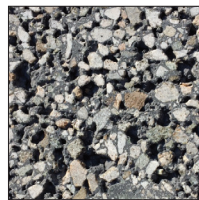
3604 FRENCH GRAY