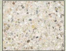
CR EA 501 Del Rio

Acceptability of the contrast in color between the integral detectable aggregate stripe and the precast tread is the responsibility of the buyer. For testing by others, a sample of the combination chosen can be provided upon request. All products are made of natural materials. Colors may vary. Always refer to actual color concrete samples before ordering. Visit stepstoneinc.com Stepread Color and Finish Chart to see full range of color and finish options.