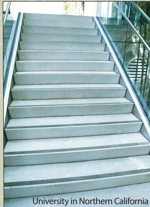
University in Northern California