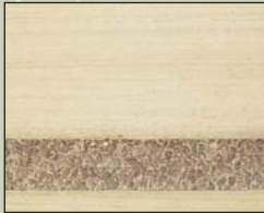
CR BS 506 Almond