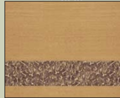
CR BS 510 Caramel