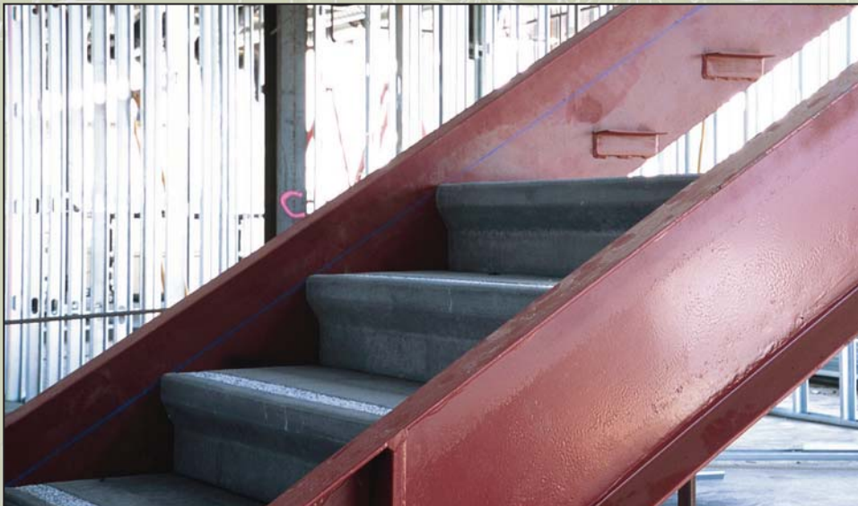
Jobsite installation of Stepreads.

Acceptability of the contrast in color between the integral detectable aggregate stripe and the precast tread is the responsibility of the buyer. For testing by others, a sample of the combination chosen can be provided upon request. All products are made of natural materials. Colors may vary. Always refer to actual color concrete samples before ordering. Visit stepstoneinc.com Stepread Color and Finish Chart to see full range of color and finish options.