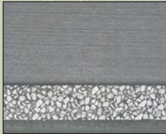
CR BS 504 French Gray