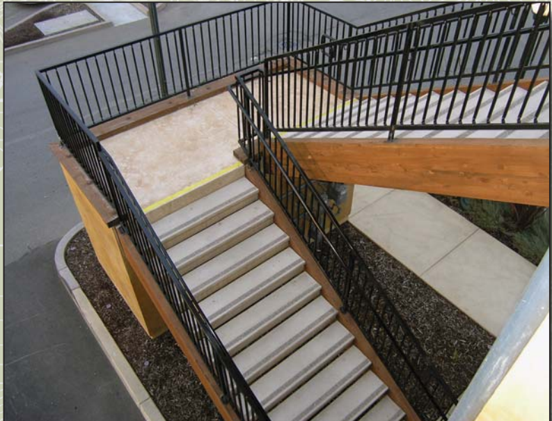
Elegant and durable precast concrete stairtreads Bolt-on-to-Wood stringers.